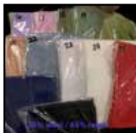
FELT SELECTIONS - CONTACT LEI BATTY FOR PURCHASE

PROGRAMS NOTES: 1 - To enter ZOOM meeting, instructions are available on the attachment provided. 2 - The Honolulu Museum of Art School - Linekona, re-opening is still pending. We have not found a suitable meeting room replacement and will be continuing Zoom meetings until further notice